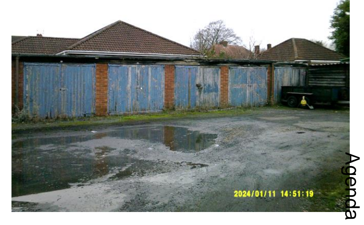
View looking north towards 3A Willow Road