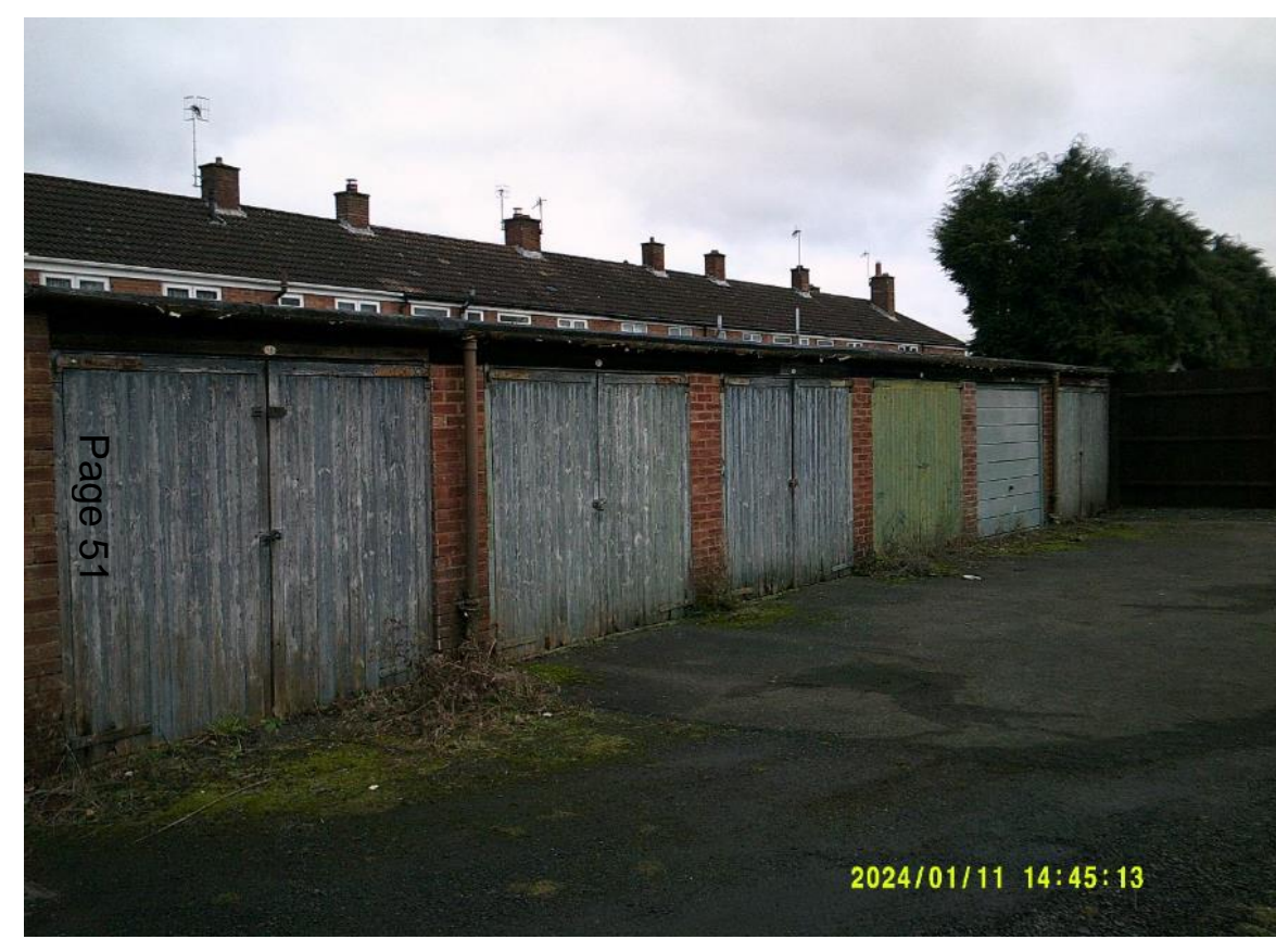
View looking west towards rear of 17-19 Willow Gardens