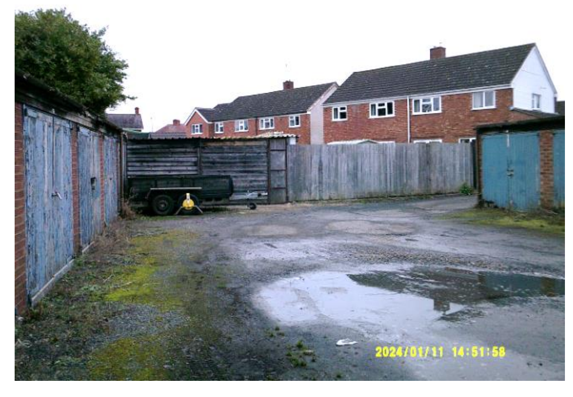
View looking east towards 8 Willow Gardens