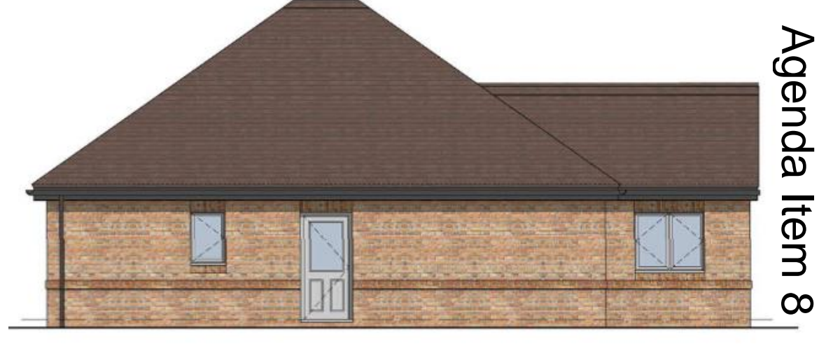
Rear Elevation (towards 3A Willow Road