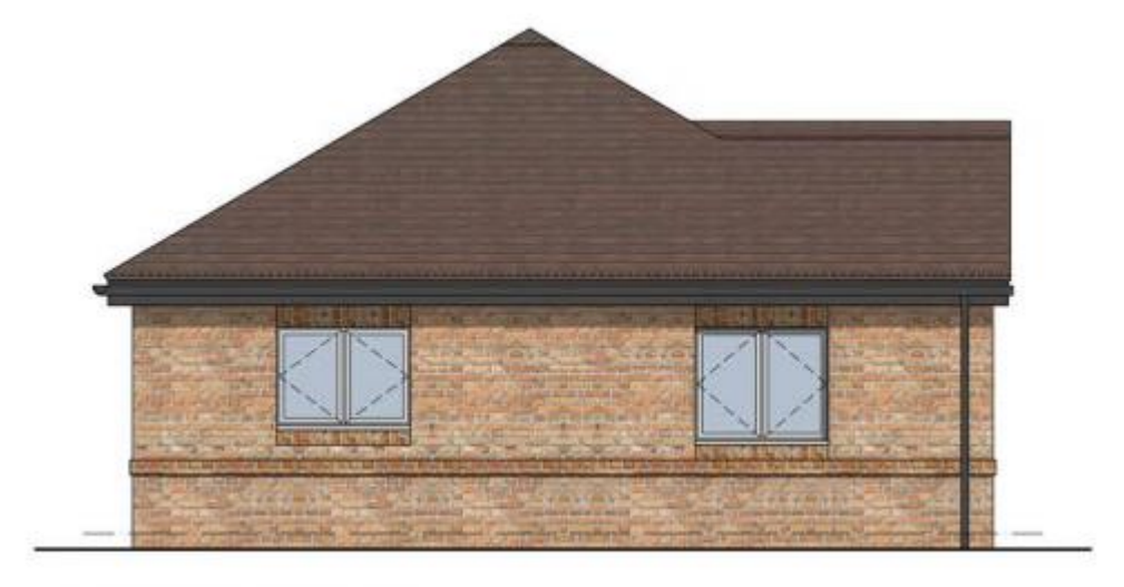
Rear Elevation (north)