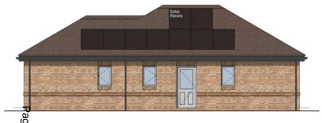
East Elevation towards 14-18 Church Road