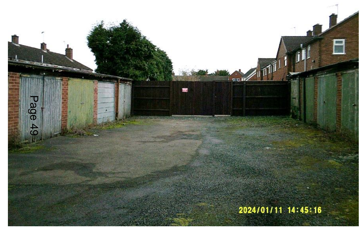
View looking north towards No.12 Church Road garden