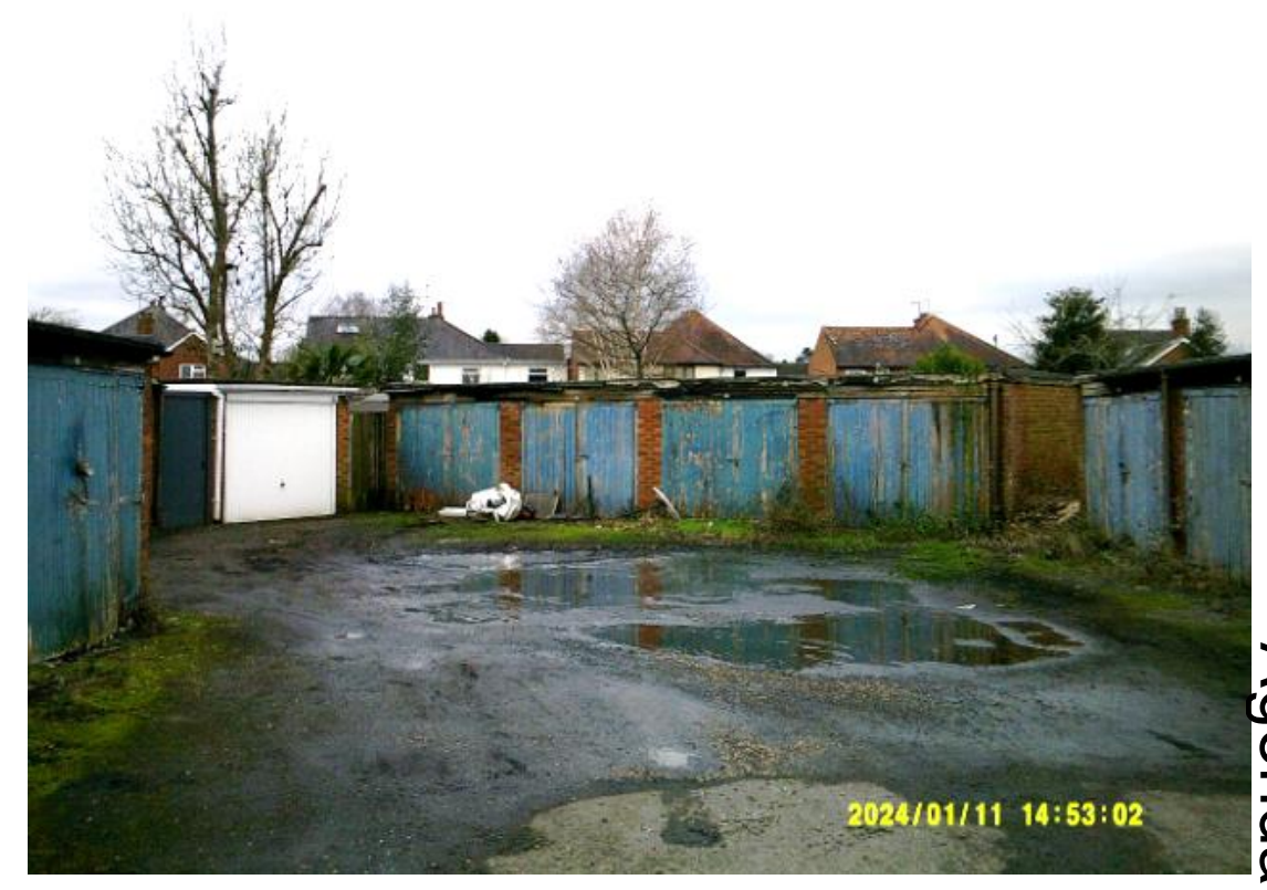
View looking west of existing garages