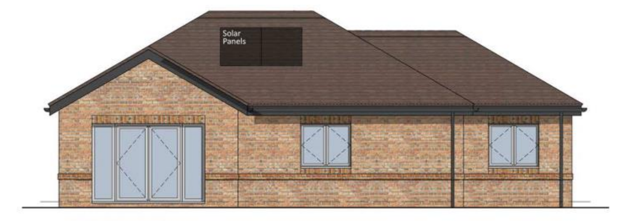
West Elevation towards proposed garden