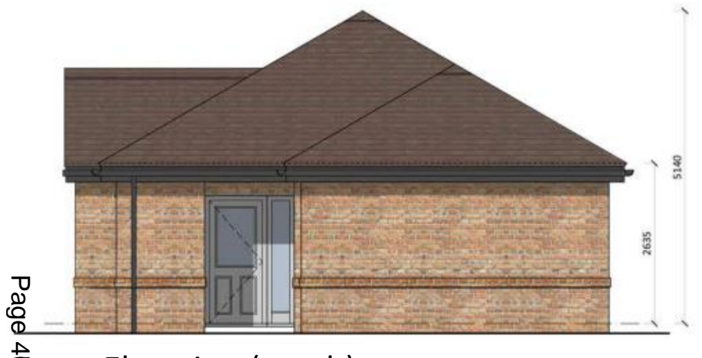
₱ront Elevation (south)