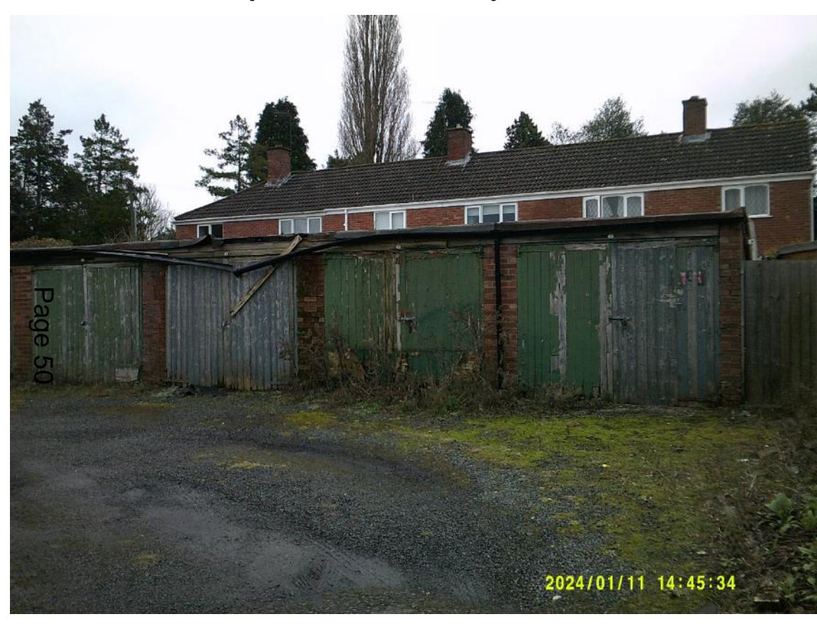
View looking east towards rear of 14-18 Church Road