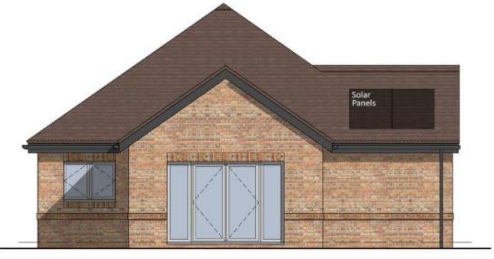
West Elevation towards proposed garden